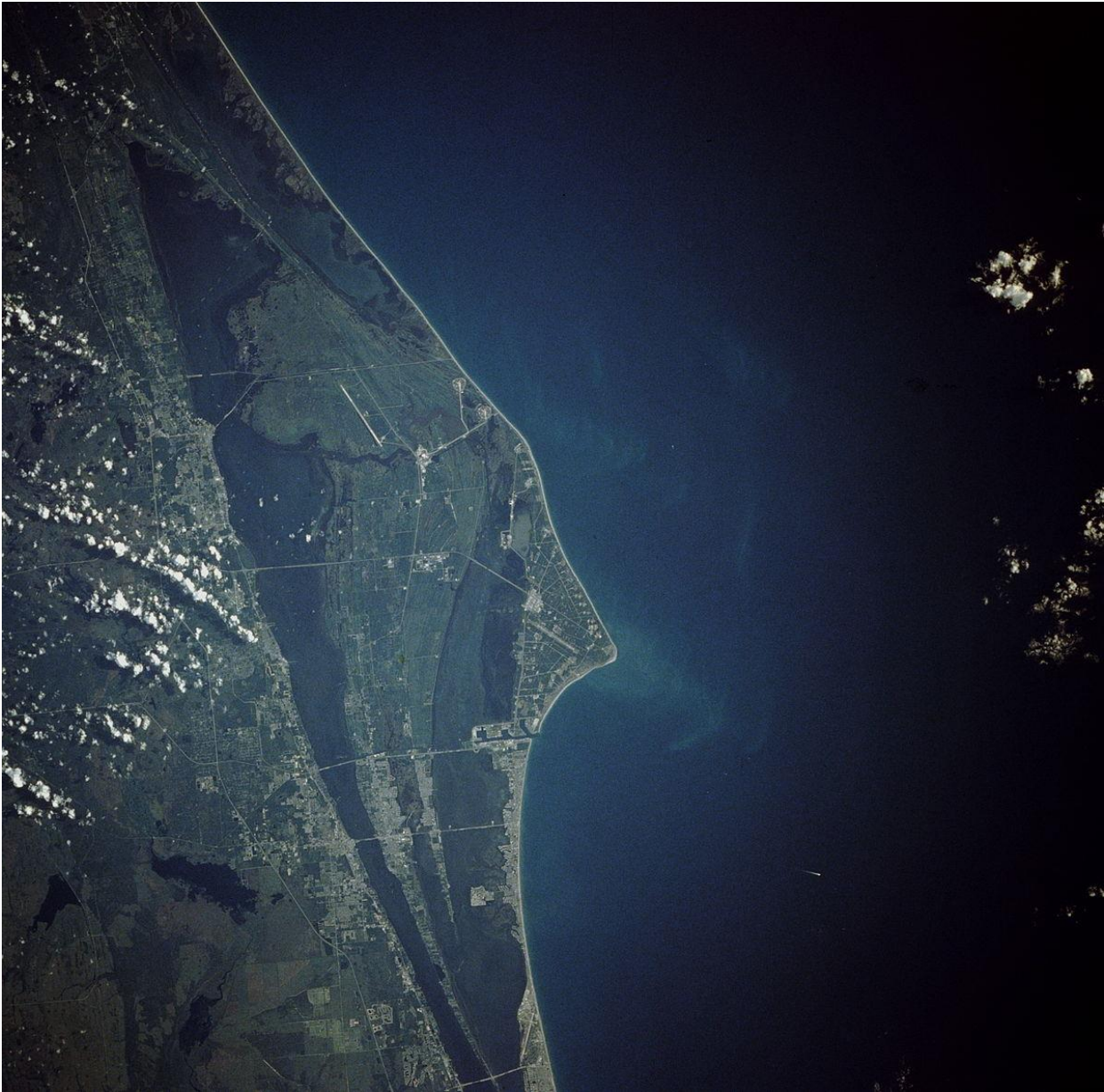
Cape Canaveral, Florida.