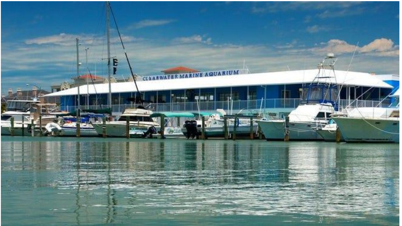
Clearwater Marine Aquarium.